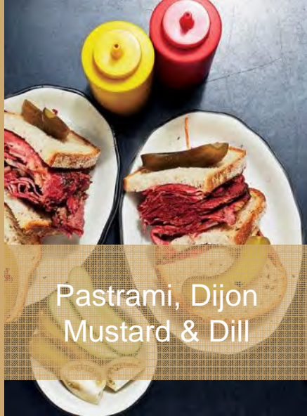
Pastrami, Dijon Mustard & Dill