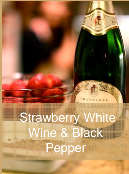
Strawberry White Wine & Black Pepper

snacks to savor for great snacking moments