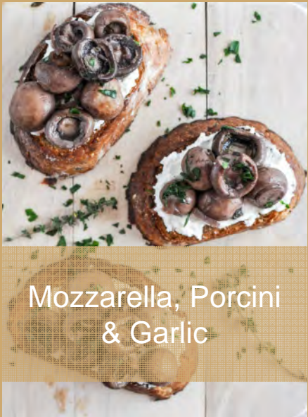
Mozzarella, Porcini & Garlic