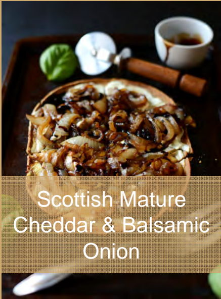
Scottish Mature Cheddar & Balsamic Onion